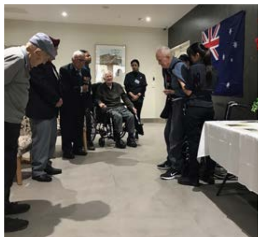
Residents of Blue Cross conduct an ANZAC Service