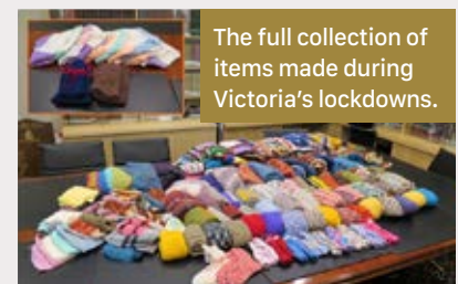
The full collection of items made during Victoria's lockdowns.