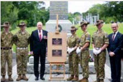
305 Army Cadets with Governor General and Senator Raff Ciccone