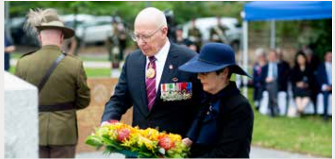
Governor General & Mrs. Hurley laying Wreath