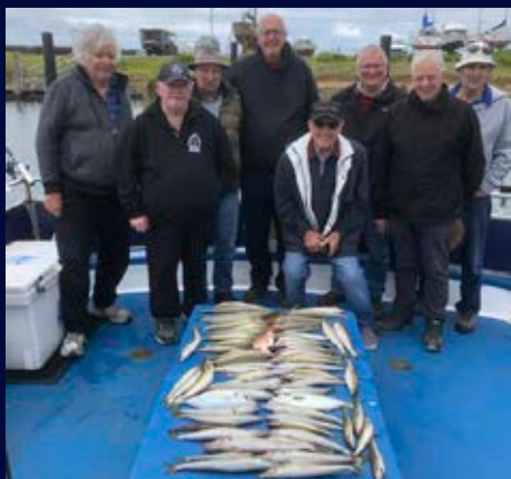
A photo of our catch.

We continued to move to various locations and were able to catch a variety of fish at most stops, although whiting was the most prevalent species caught. At about 11:00am, the boat captain cooked up a heap of sausages and we all had snags in bread rolls as our lunch time snack.