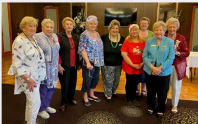
Women's Auxiliary Committee

Thank you to all Committee members for their contribution and set up. Members and guests went home bellies full, with no intention of having tea, after having such a nice, filling day.