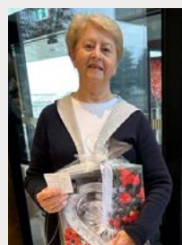
4th prize: Mikasa Heart

Congratulations to all, well done and a big thank you to all that took part.