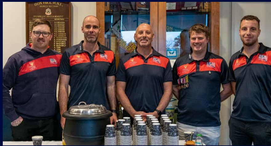
Volunteers Box Hill Nth Football Club