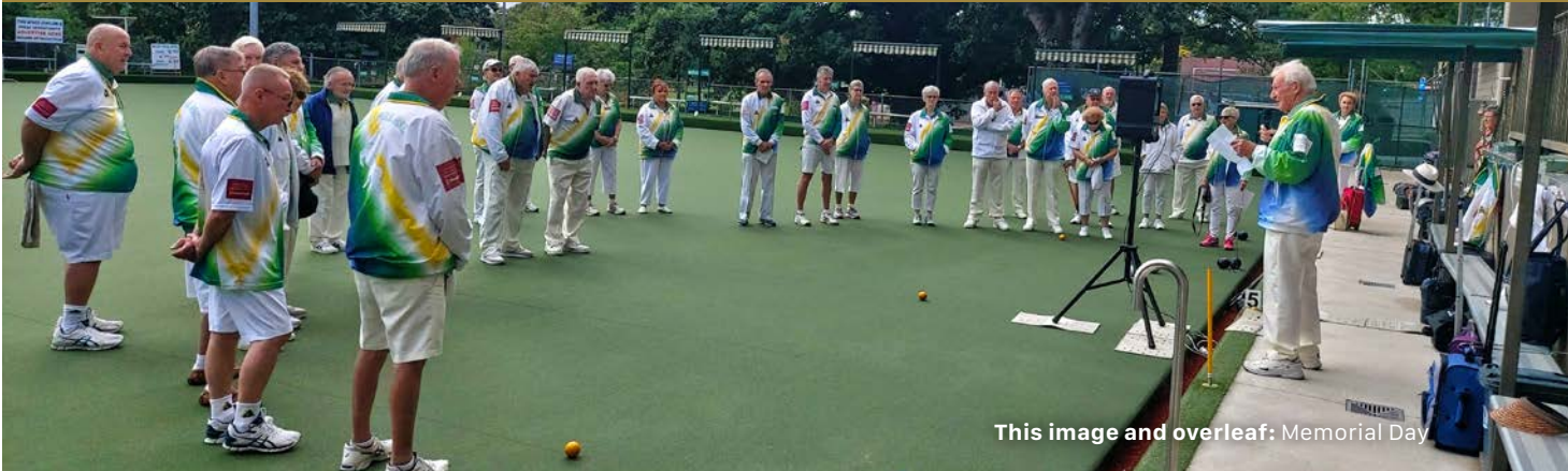
This image and overleaf: Memorial Day

April was a very busy month for our Club commencing with Memorial Day on Saturday April 8th when we had 35 bowlers in attendance.