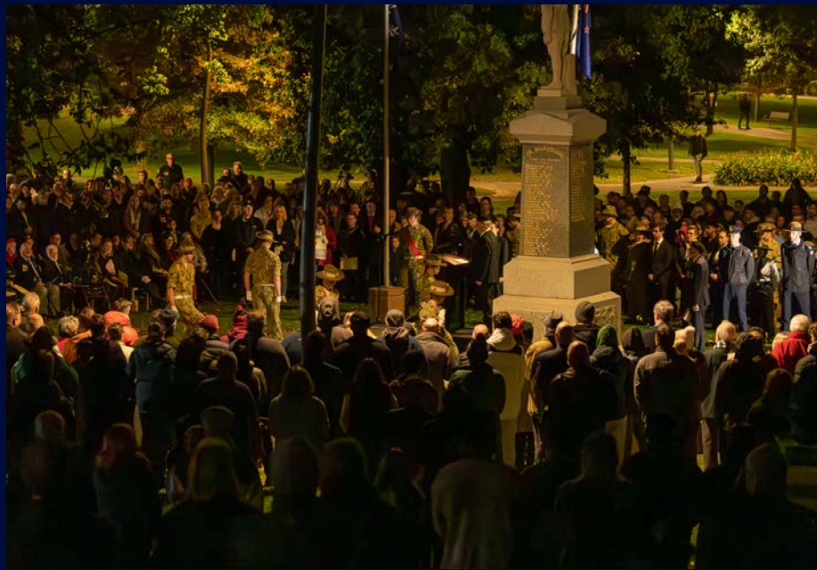
Crowd attending the Dawn Service