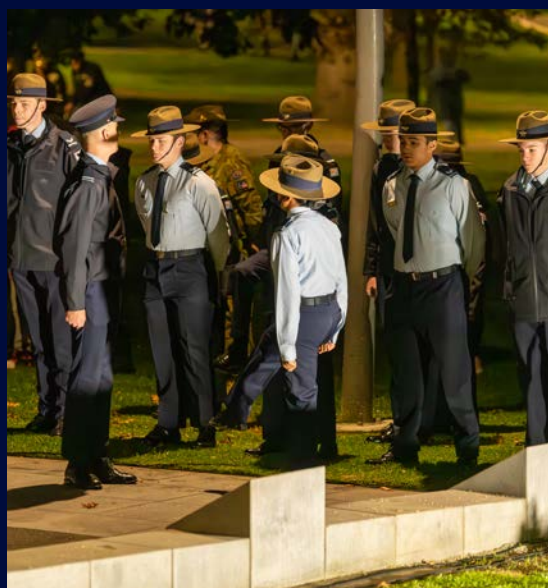
401 Squadron Air Force