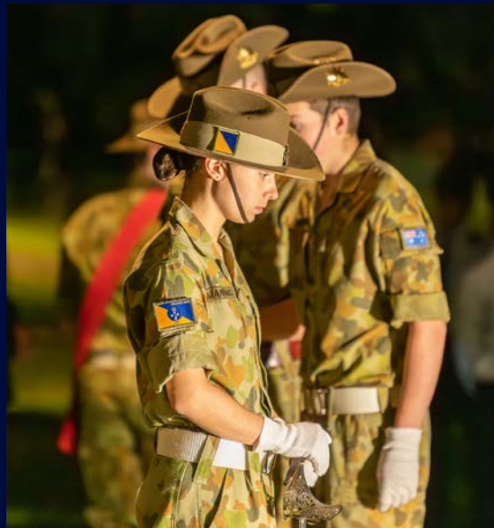
305 Army Cadets Unit