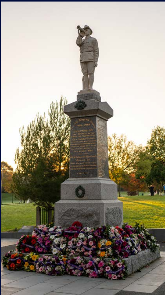
World War One Memorial with wreaths