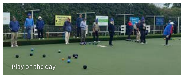
Play on the day