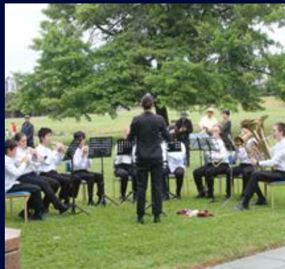
The Box Hill Academy of Brass Band