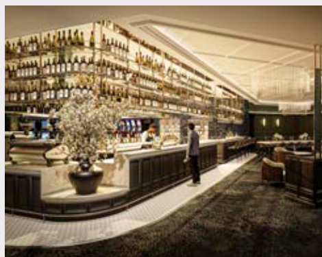
Above: Concept of finished bar.

meticulous attention to detail, featuring a carefully curated wine selection, an extensive spirit list, creative cocktails, and a diverse range of beers. This exceptional space will also offer an enticing small bites menu, ensuring a complete experience of relaxation and indulgence.