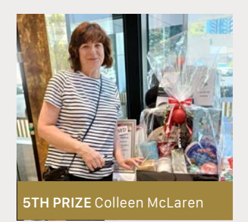
Above: Christmas Raffle Winners.