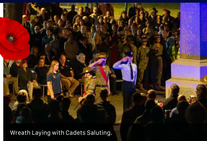
Wreath Laying with Cadets Saluting.