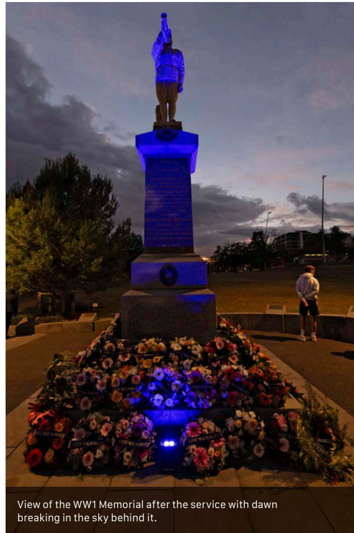
View of the WW1 Memorial after the service with dawn breaking in the sky behind it.