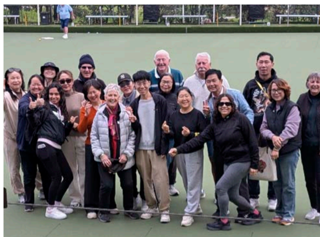
Above: Our visitors with the helpers.

We recently had two groups from Box Hill TAFE, who are new immigrants to our country, come over to our club. We showed them how to bowl, which was a lot of fun. In the process we also helped them with their language skills by conversing with them. That proved a bit tricky for our visitors and also for our members. It was a lovely day, and we hope it will be the start of a great relationship with the Box Hill TAFE.