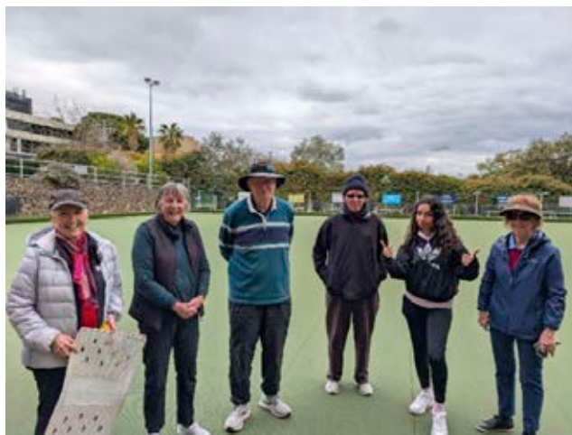
Above: Our very experienced bowlers being thanked by one of our guests.

We have several new members who have joined us from several local clubs for this coming season. We welcome them and hope they will come to love Box Hill RSL Bowls Section as much as the rest of us do.