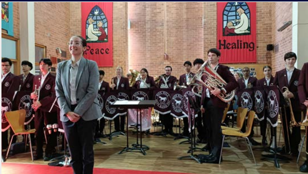
Above: Box Hill Academy of Brass

performance you would expect to pay top dollar to experience at Hamer Hall Arts Centre Melbourne.